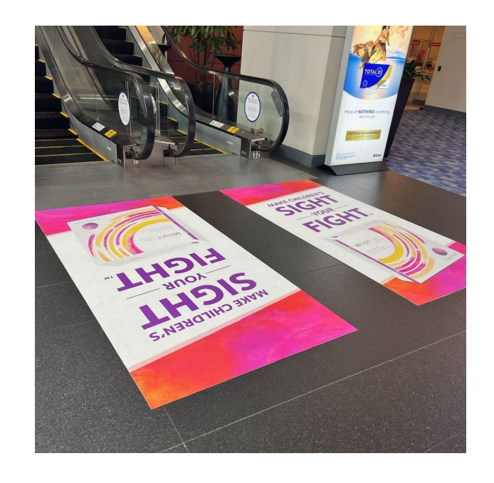
Floor Decals in Lobby See full opportunities packet for pricing!